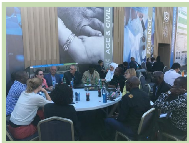
PAFO-AgriCord delegates- working session on the Farmers Climate Facility project