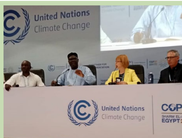
PAFO President at a discussion panel during Farmers market side event at COP27