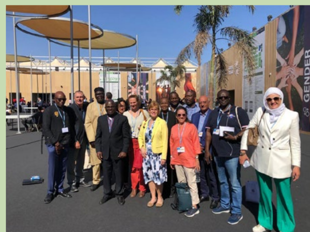
Meeting participants PAFO - Agricord