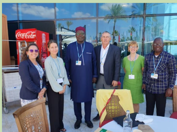
PAFO & Agricord Presidents