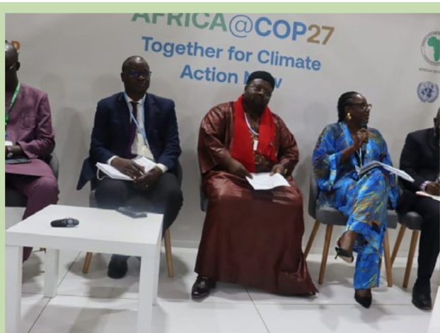
PAFO CEO during the AfDB CSO side event at COP27